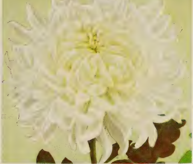
SILVER SHEEN. 50c each; 3 for $1.25